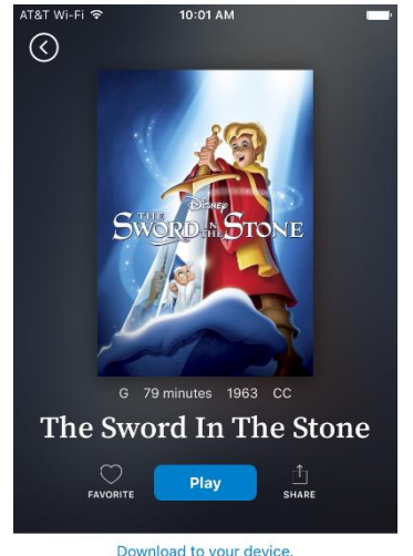
When the King of England dies without leaving an apparent heir to the throne, the magician My Hoopia Video Music Books Search